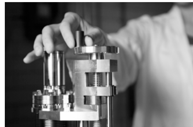
The components pictured, part of OCCAM's new x-ray photoelectron spectrometer (Thermo Scientific EscaLab 250Xi), allows for in-vacuo sequestering of samples, as well as transfer of samples between orthogonally oriented vacuum chambers.

Is it any surprise that ChemE professors are recognized nationally and internationally for their significant contributions to bioengineering?