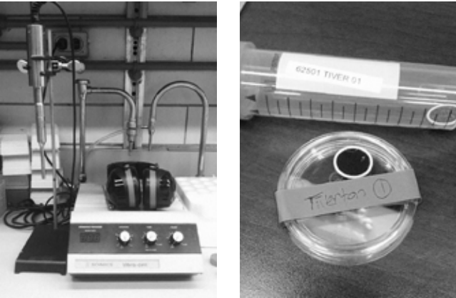
Jandi Kim and team used the titanium probe sonicator to extract particles loaded on the Tapered Element Oscillating Microbalance (TEOM) Filter.

after incubating the samples with the “lung lining” for several hours, she measured how much these anti-oxidants had been depleted.