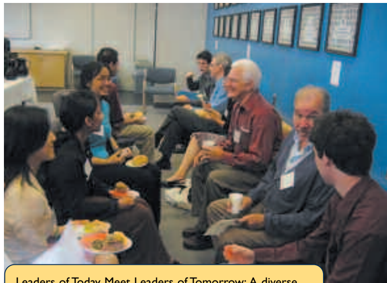
Leaders of Today Meet Leaders of Tomorrow: A diverse group of Chemical Engineering Alumni share their career experiences with current undergraduate students

As this well received program has evolved, students have asked for more alumni/ae involvement. On Friday, September 24, the Department hosted an event called Leaders of Today Meet Leaders of Tomorrow, which was