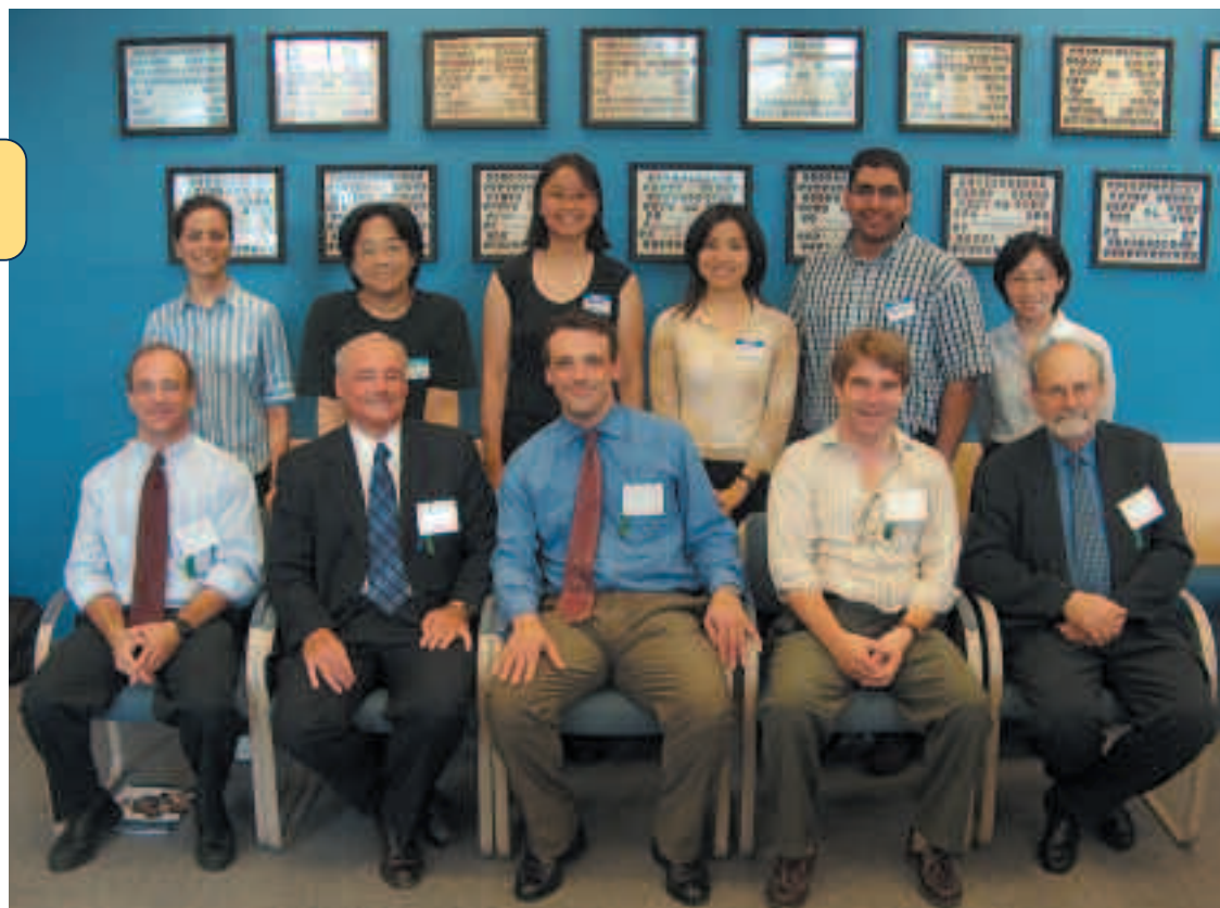
Common room donors and design team

The Department hopes to establish more awards that recognize leadership qualities, with the goal of encouraging students to interpret the engineering profession in the broadest possible terms.